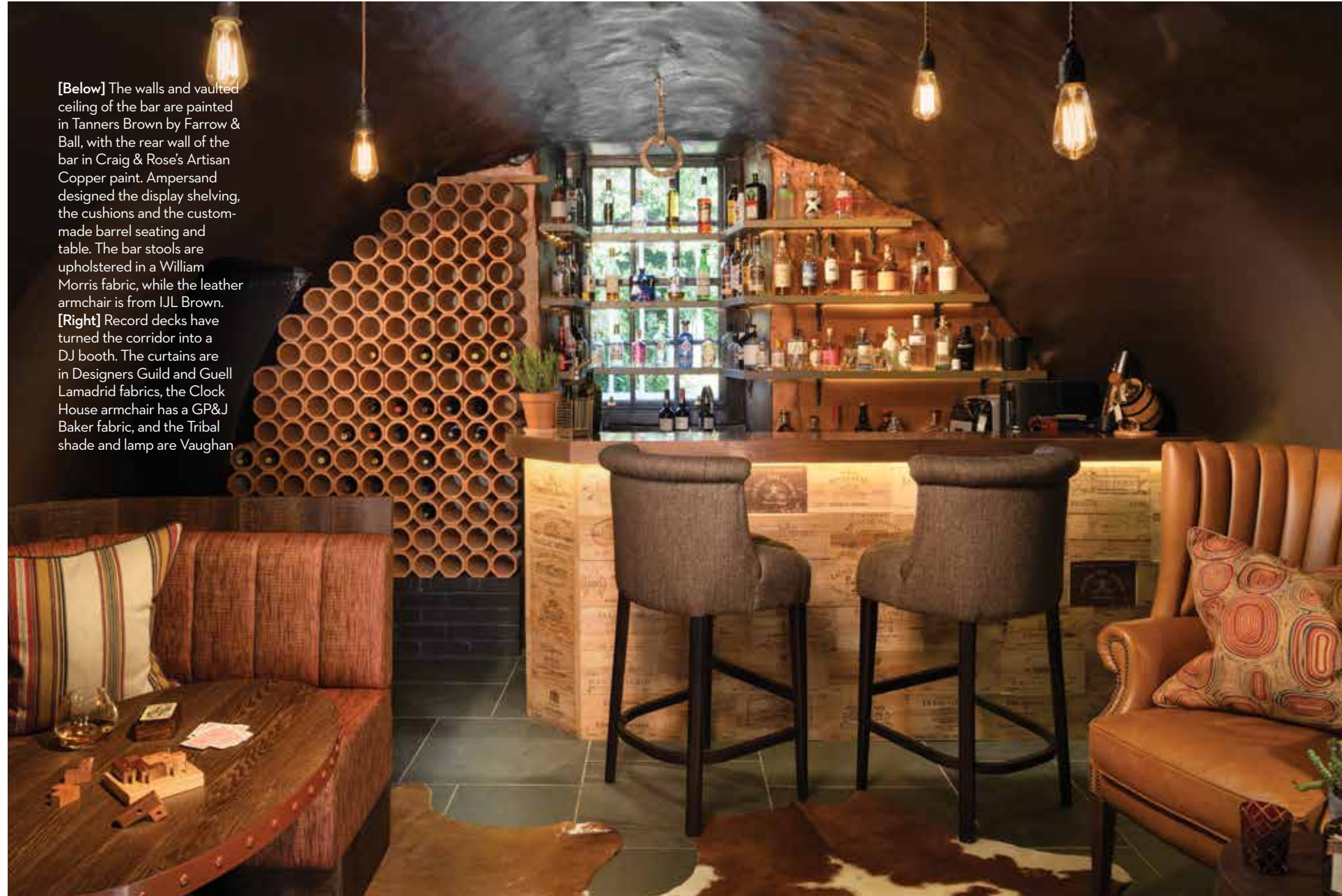
[Below] The walls and vaulted ceiling of the bar are painted in Tanners Brown by Farrow & Ball, with the rear wall of the bar in Craig & Rose's Artisan Copper paint. Ampersand designed the display shelving, the cushions and the custom-made barrel seating and table. The bar stools are upholstered in a William Morris fabric, while the leather armchair is from IJL Brown. [Right] Record decks have turned the corridor into a DJ booth. The curtains are in Designers Guild and Guell Lamadrid fabrics, the Clock House armchair has a GP&J Baker fabric, and the Tribal shade and lamp are Vaughan